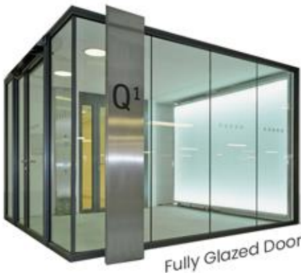
Fully Glazed Door