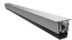
Drop Seal (Automatic Door)