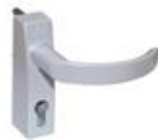
External Trim (Fittings)