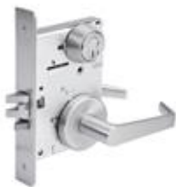
Mortise Lock with Lever Handle