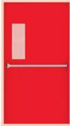
Fire Door CBRI - BFRC