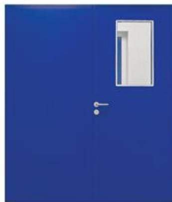
Clean Room Door