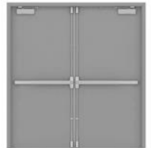
Panic Bar (Multi Point Locking System)